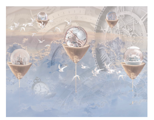
"Timeless Realm" digital collage by Eleanor Roosevelt junior, Venus Liu.