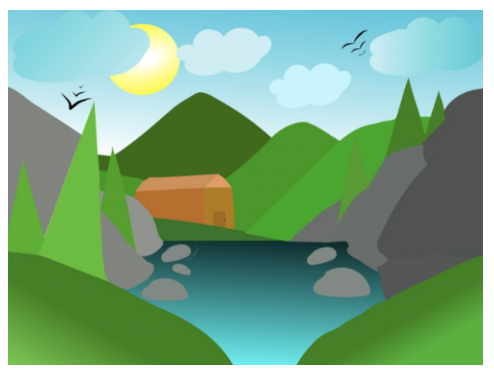
"Mountain View" using Adobe Illustrator, by Soneta Ly.

Hello everyone! For this year at High Point High School we have continued to do a digital show for our students, staff, and parents. We thought it would be wonderful if other art teachers in PGCPS would take a look at the show. The art show encompasses over 200 works of art with written art statements from each student. This art show was not only put together by teachers, but students as well! Some students have even customized their own panels to fit their unique artwork. Here is a link to the show. Hope you all enjoy the work!