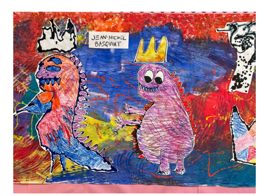
Classroom collaborative art; Basquiat inspired mural.