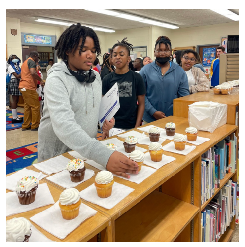
Visual Art Majors being rewarded with a treat after the award ceremony and art exhibition.

"Thanks so much for sharing this! We could not make it tonight but love our child's work that we never get to see! Much appreciated!" - Proud parent