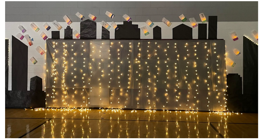
Senior Prom 2023: Floating Lanterns above the City Skyline.