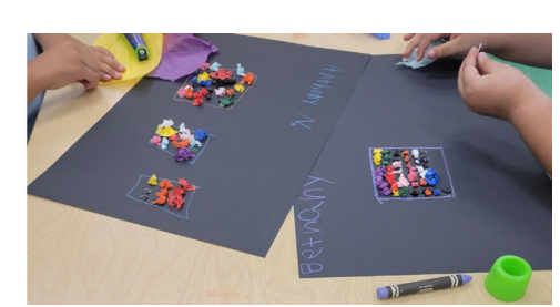
Collage by 1st Grade.