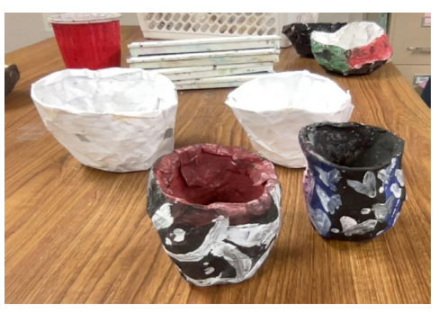
One sheet paper mache bowls.

Also the assignment allowed them to take functional art home.