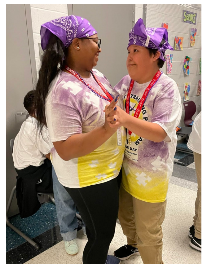
Dancing to Celebrate at the FHHS Regional/CRI Art Show.

We hope your spring has been filled with wonderful memories, just like ours!