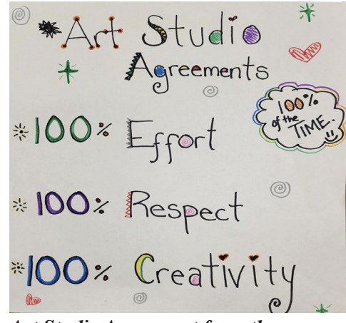
Art Studio Agreement from the beginning of the school year, 400%.

One of the highlights of my first year was entering pieces for my