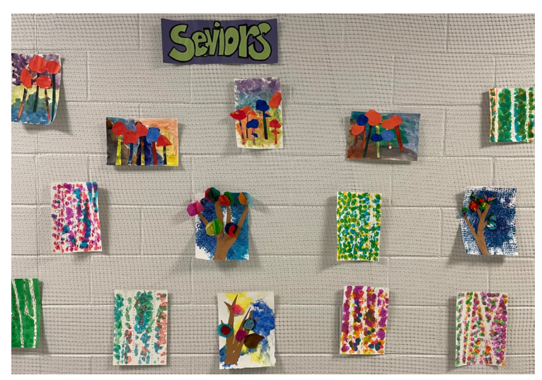
FHHS Regional/CRI Art Show: Art by Graduating Seniors.