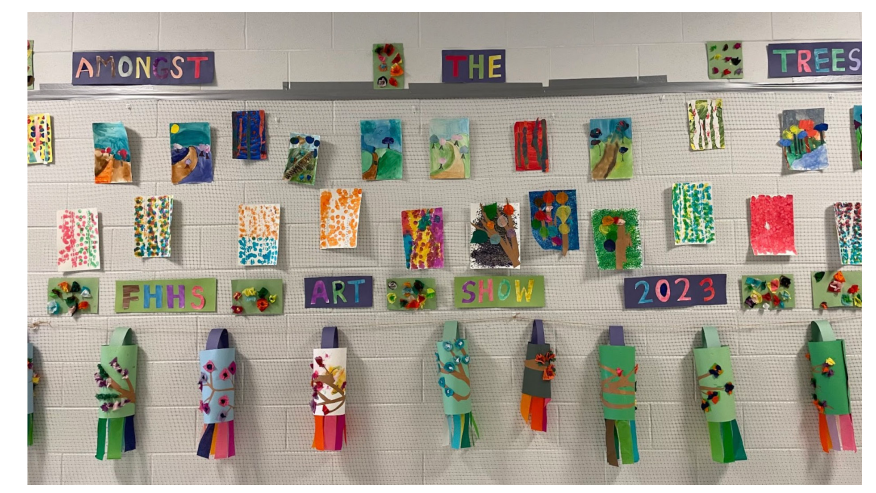
"Amongst the Trees" FHHS Regional/CRI Art Show.