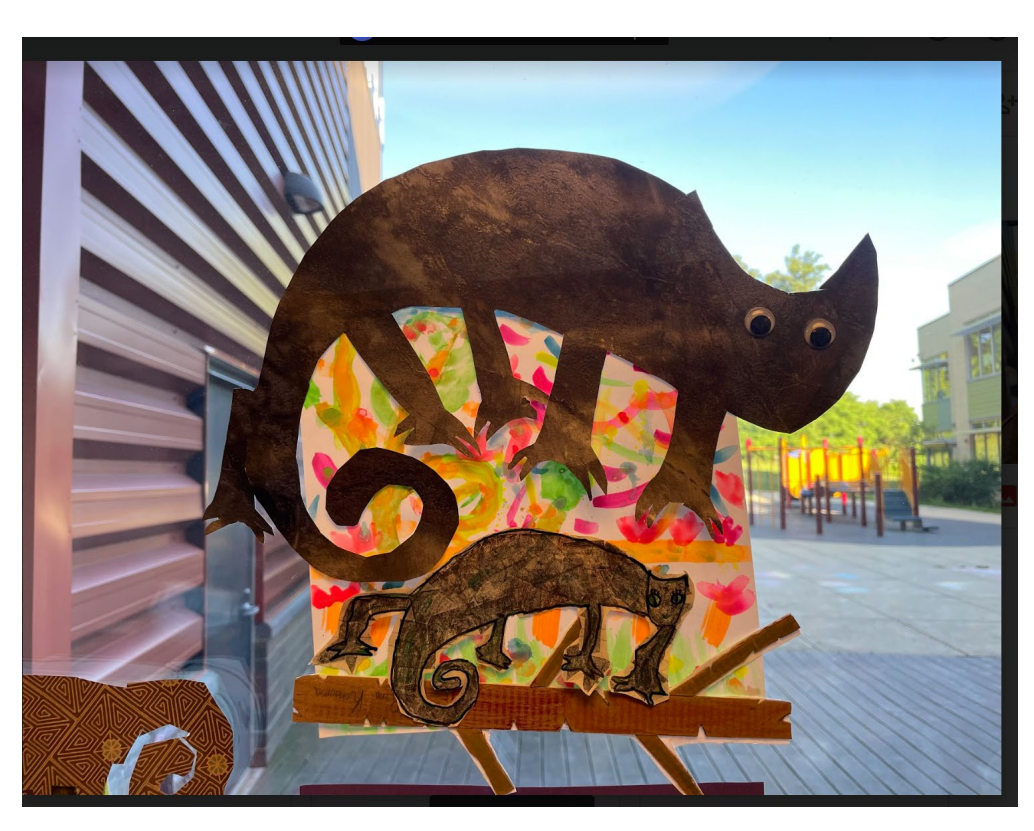
Wall paper sample and graphite-shaded coffee filter chameleons

separate assignment, the students painted colorful nature backgrounds and assembled tree branches from cardboard. Some used the tree branch to make a mono-print onto the painted background. For still another assignment, the chameleon's silhouette was captured and stylized using wallpaper samples. We noticed how the googly eyes added personality to the chameleon's character. With each art lesson, we reiterated that the chameleon was the subject of our artwork and considered how to arrange supporting details like the tree branch and painted background in a balanced composition.