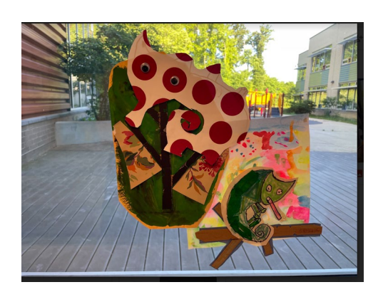
The chameleons were thoughtfully placed within the composition

VA:Cn10.1.2a Create works of art about events in home, school, or community life.