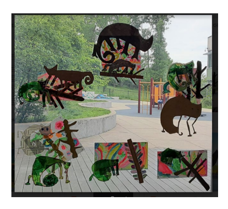
Individually curated student art collections

Finally, the students applied organizational skills by curating their art collection for a hallway exhibit: 1- 2 chameleons, a tree branch, and a colorfully painted background.