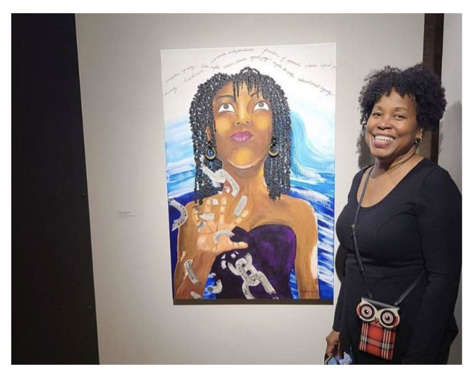
View the online catalog <a href="https://nationalwca.org/wp-content/uploads/2022/01/Occupy-the-Moment.pdf">https://nationalwca.org/wp-content/uploads/2022/01/Occupy-the-Moment.pdf</a>

WCA began their year long, 50th anniversary celebration with an art exhibit at the Bridgeport Art Center, Chicago, Illinois, Occupy the Moment: Intersect History with Impact . The artwork celebrates our strengths and accomplishments and explores how we are moving to embrace new agendas and support emerging voices going forward.