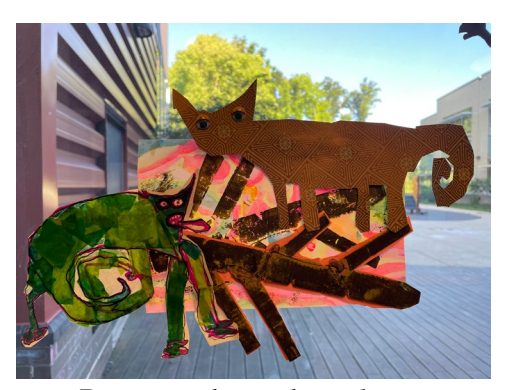
Distinguishing chameleon characteristics and background details support storytelling

The chameleon was a good subject to feature in an art composition because of its distinguishing characteristics. The students drew pictures of chameleons paying close attention to its anatomy-- four legs, a spiraling tail, and an elongated sticky tongue.