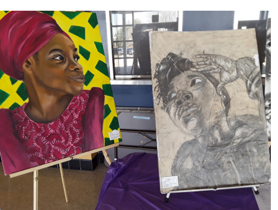
Work by Rabiatu Ladan