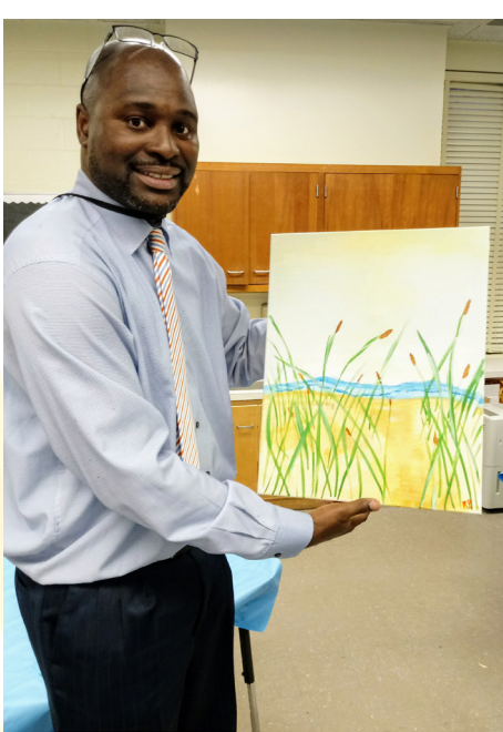
"Art therapy is a mental health profession that uses the creative process of art making to improve and enhance the physical, mental and emotional well-being of individuals of all ages."