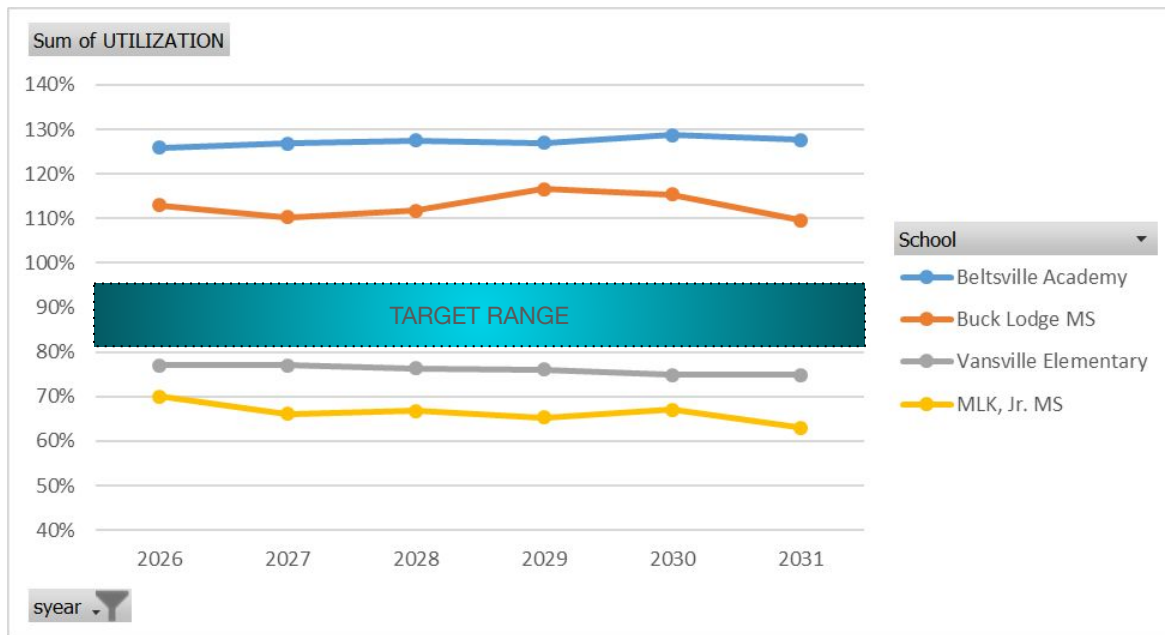
Projected Utilization Rate by School and Year

Projected facility utilization is outside the target range at Beltsville Academy, Buck Lodge MS, MLK Jr. MS or Vansville ES