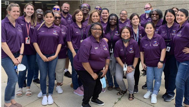
Indian Queen Elementary School team photo.

The 2021-22 school year was successful thanks to your diligence and collaboration in doing whatever it took to keep schools safe and learning in motion. Amid unprecedented circumstances, you continually demonstrated resilience, innovation, adaptability and an unwavering commitment to our students and families. Job well done! Have a safe, relaxing and well-deserved summer break.