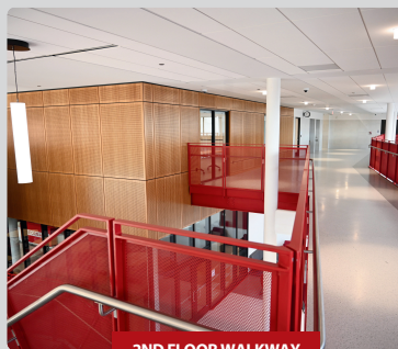
2ND FLOOR WALKWAY