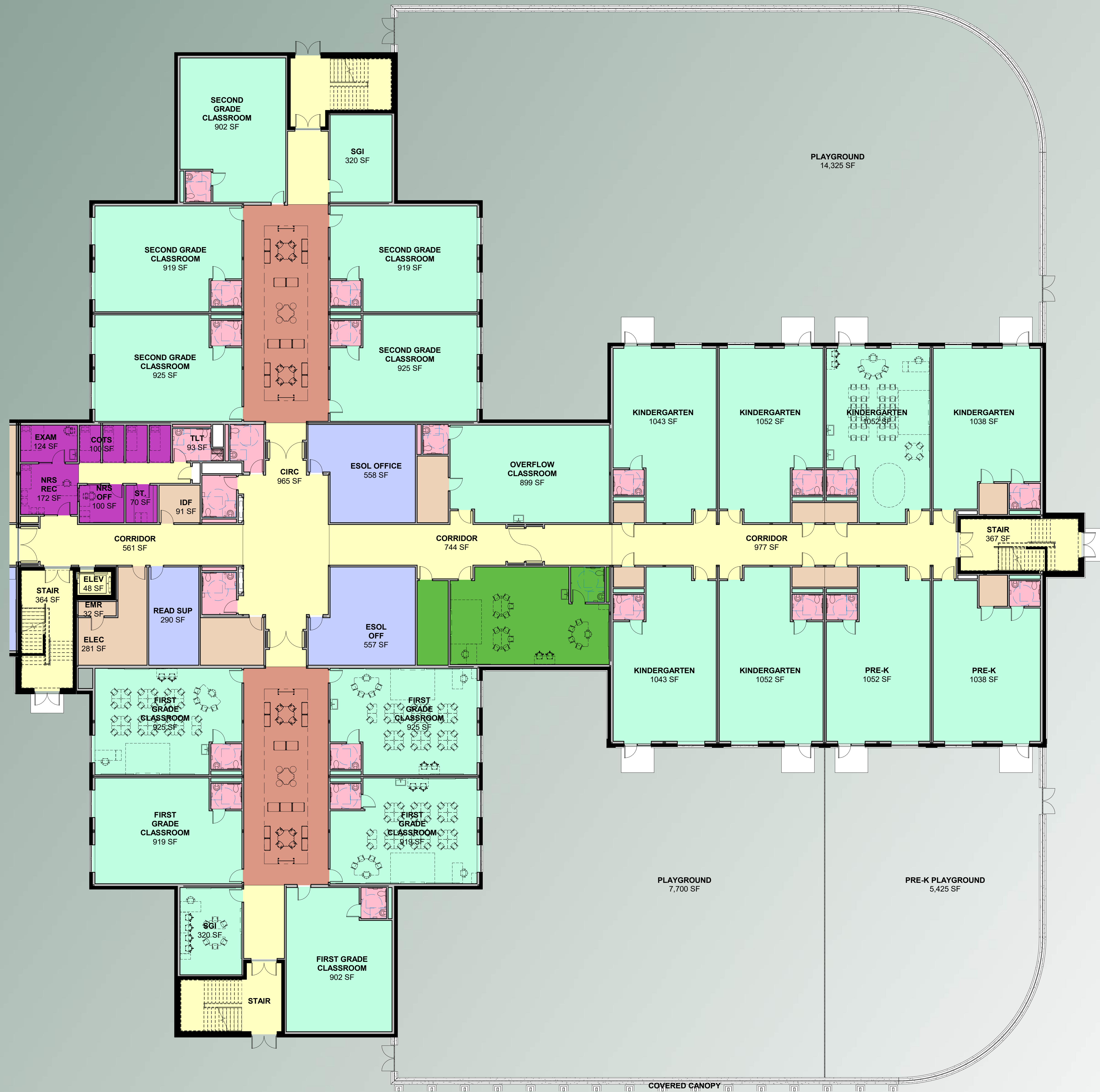
ENLARGED FIRST FLOOR PLAN - ACADEMIC WING