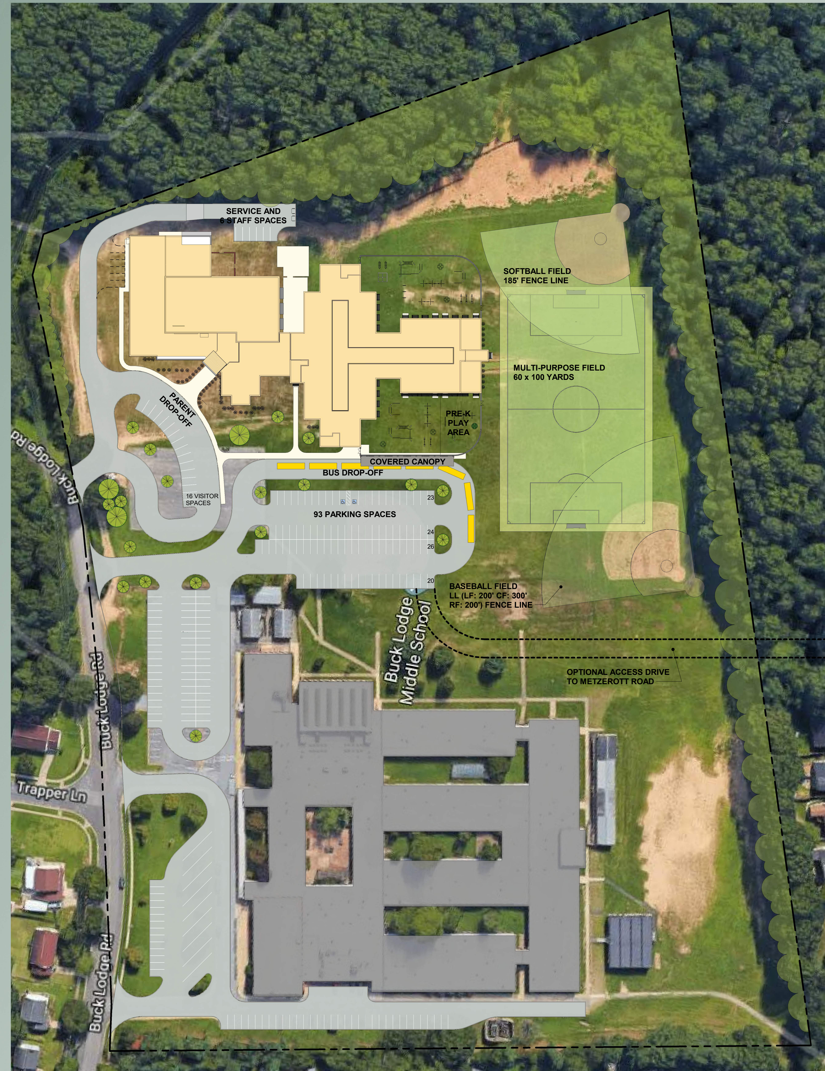
OVERALL SITE PLAN