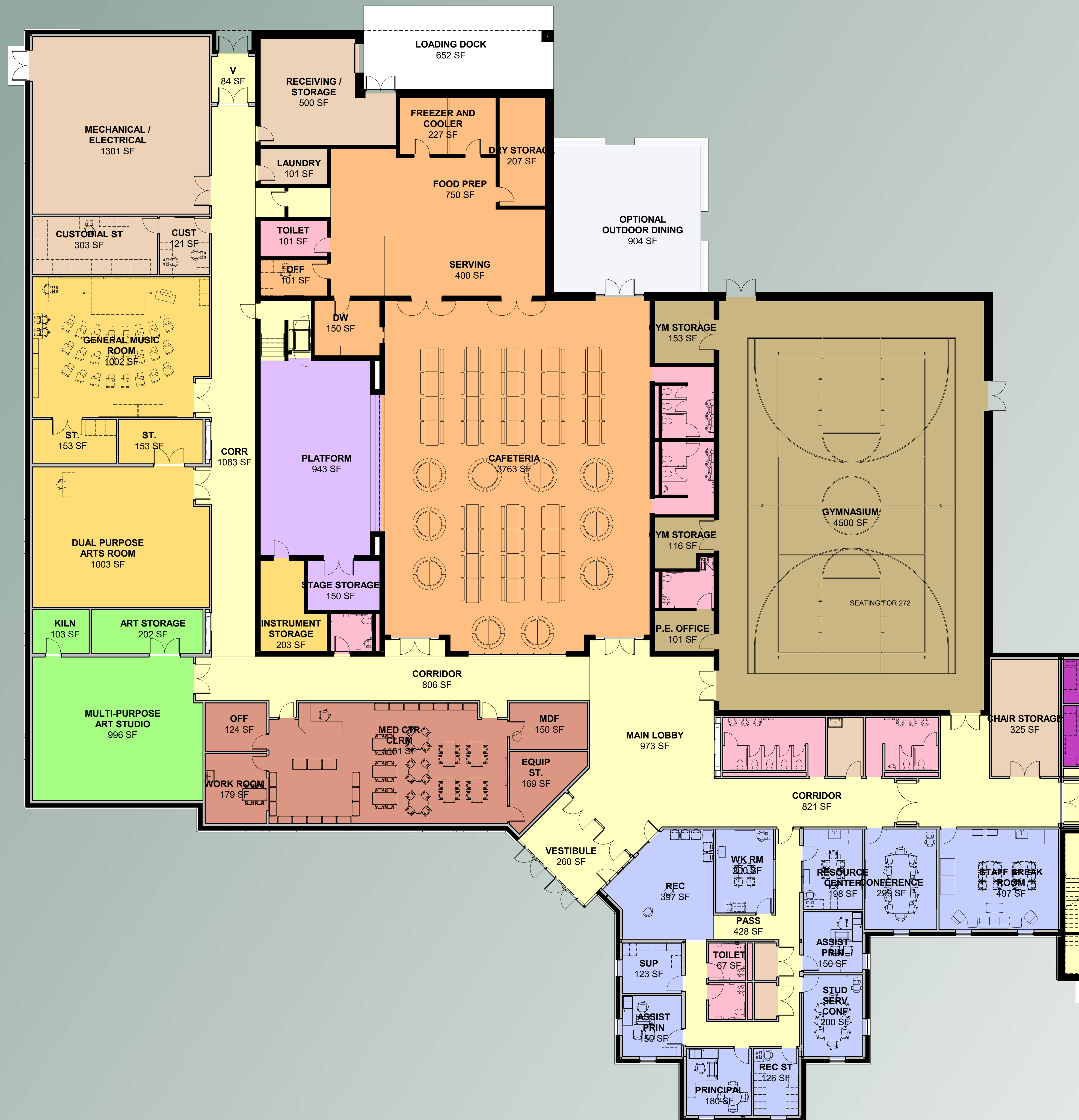
ENLARGED FIRST FLOOR PLAN