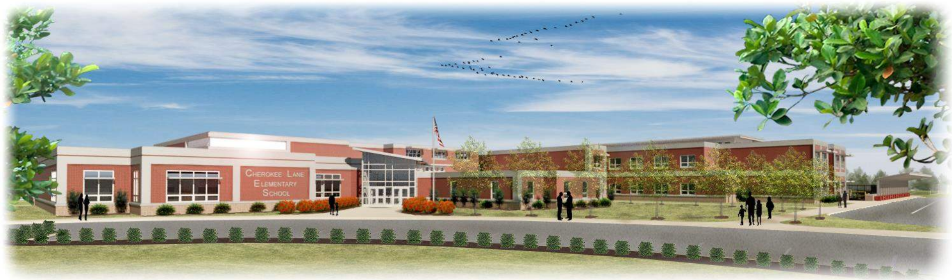
Proposed View of Front Entrance