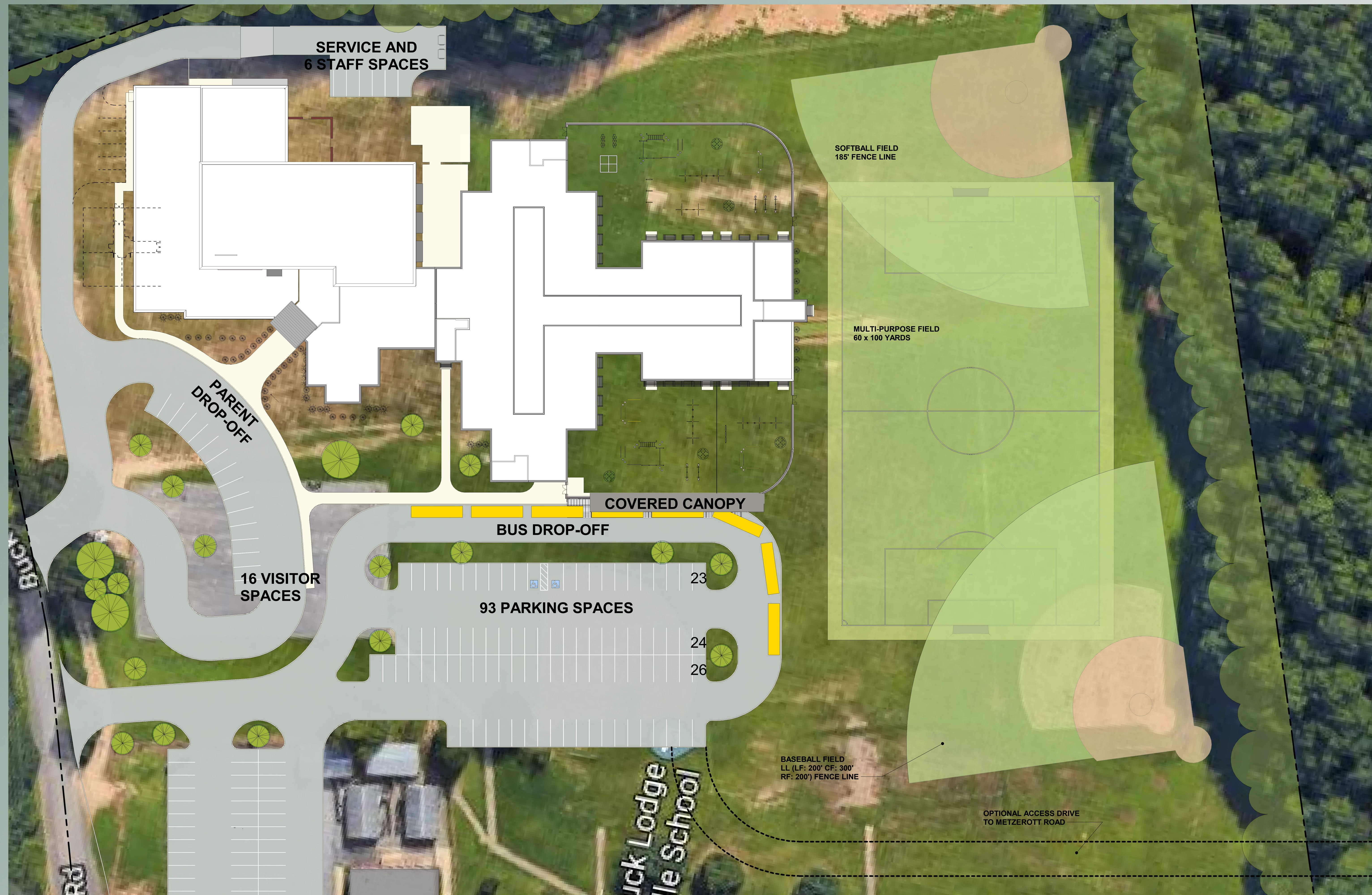
ENLARGED SITE PLAN 1" = 30'-0"