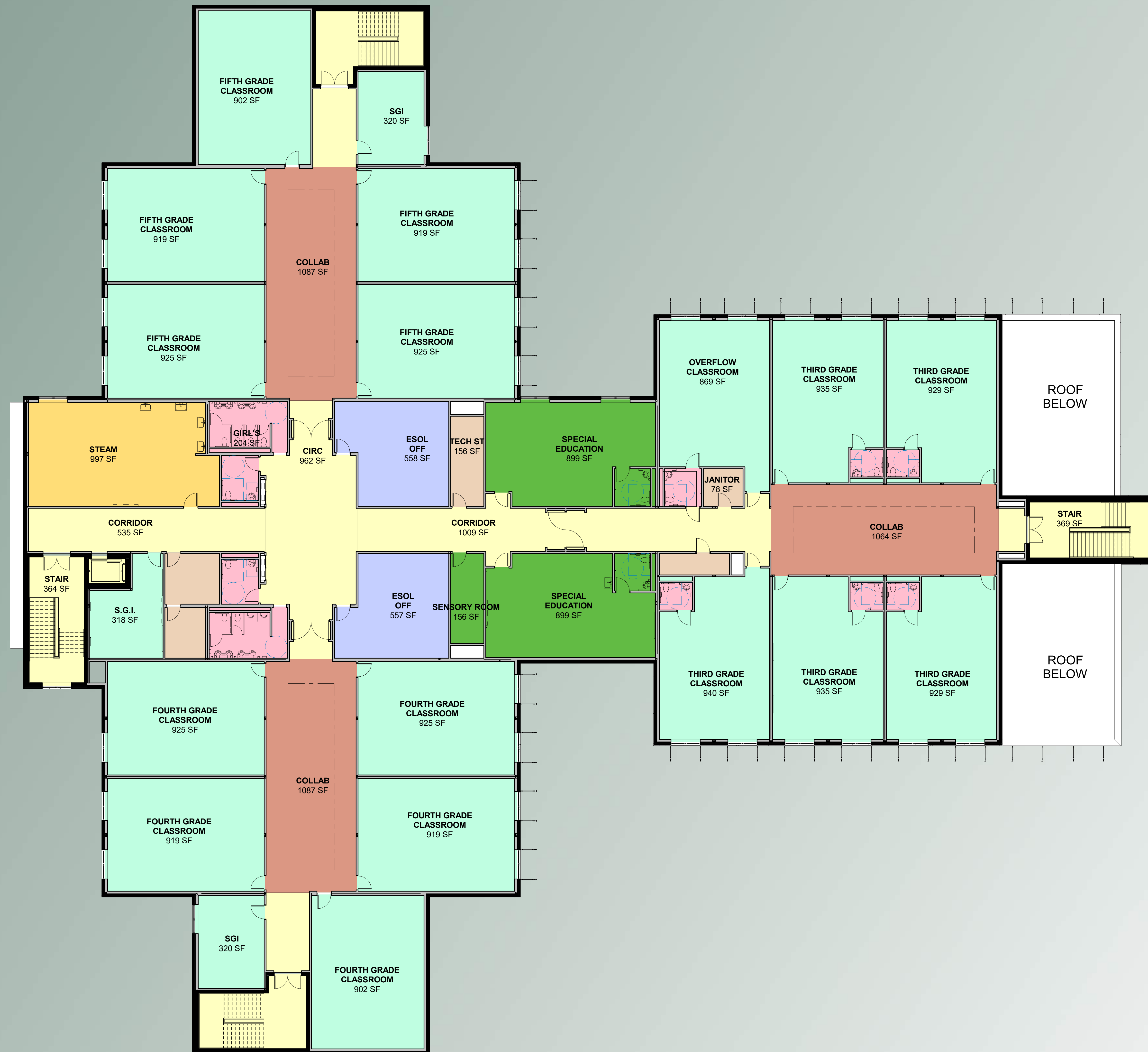
ENLARGED SECOND FLOOR PLAN - ACADEMIC WING 3/32" = 1'-0"